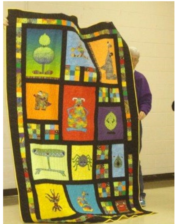
No Monsters Under the Bed by Lana Arpin