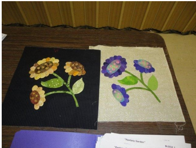
2015 Block of the Month, above 2014 Block of the Month, below