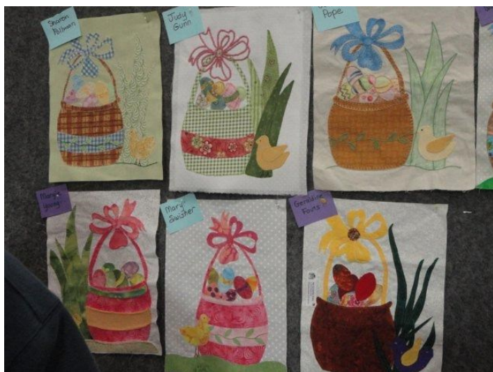
Blocks of the Month