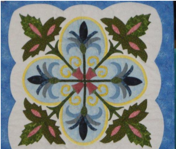
Susan Weaver's Karen Kay Buckley workshop piece

This small book collects easy-to-follow charts and tables that ease quilt planning and buying fabrics. There are charts that give the number of blocks, sashings, and cornerstones needed by size of block and size of quilt, for both straight and diagonal settings. There are eleven pages dealing with various yardage requirements. Other chapters include information matching quilt to bed size, recommendations regarding supplies, tips for cutting, and directions for piecing and binding. It is designed as a quick reference tool for all quilters.