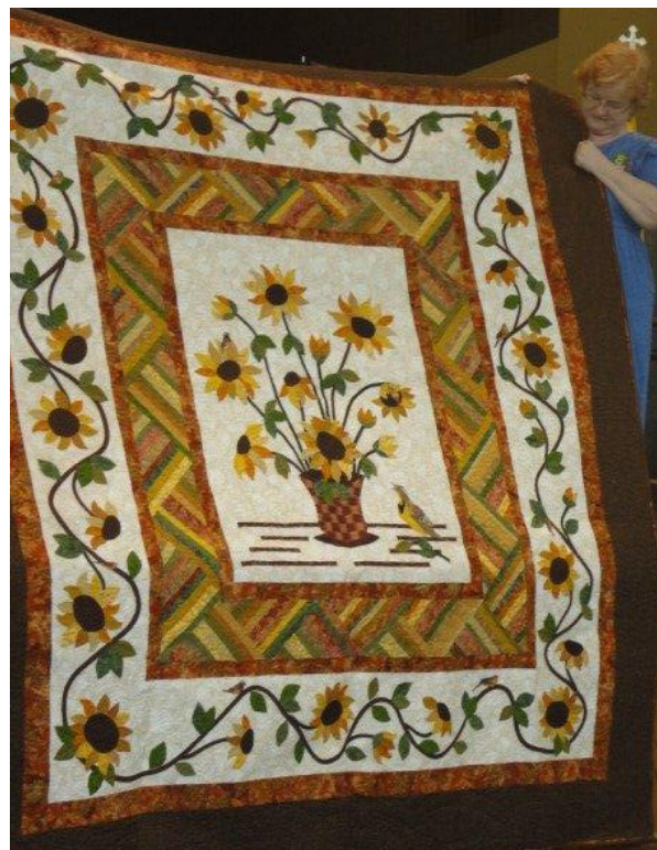
2012 opportunity quilt

Prez Sez will return for the July newsletter