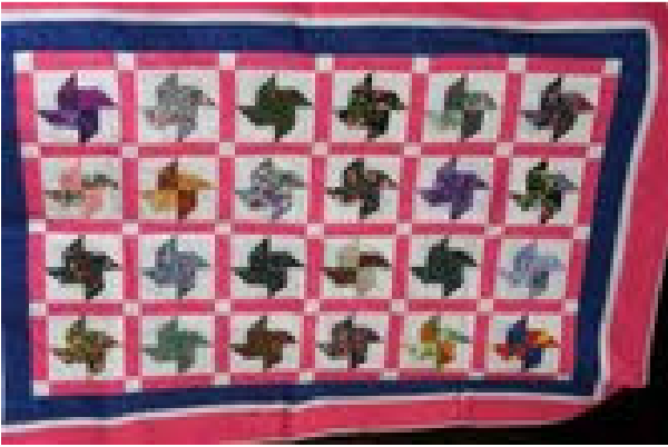
Rachel Moreland 3D pinwheel