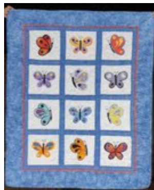
Ruth Prescott - Butterflies