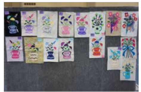
Blocks of the Month