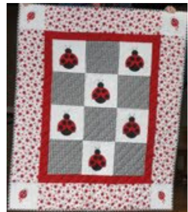
Twila Hoffman - Lady Bugs