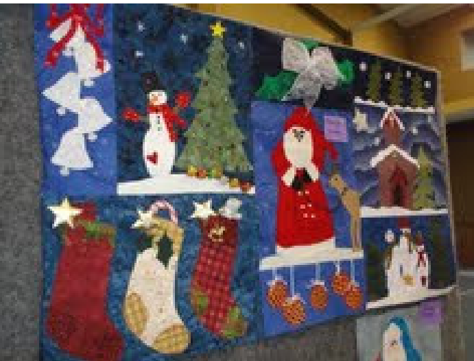
Some of the many blocks of the month from the December meeting.

2011 dues! It's that time again. Sharon Pollman is now collecting your dues for 2011. Remember to let her know if you need to make any changes in your directory information. Dues must be paid by the February meeting for you to be included in the directory. If you are waiting because you don't want to be in the directory, you can always pay now and just ask to be excluded from the directory.