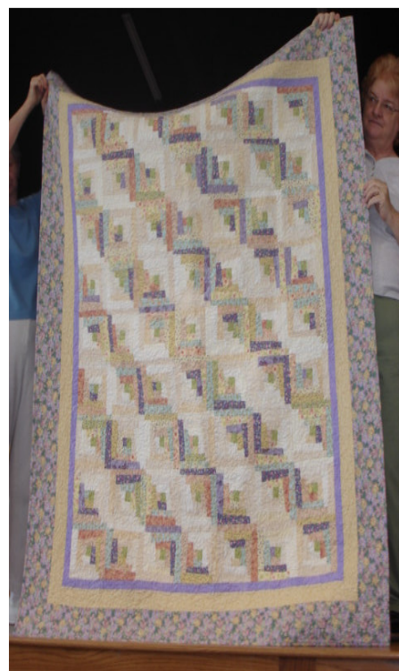
Judy Marshall's pastel log cabin variation