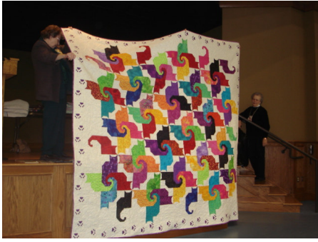
Cathy Cholick--Cats with paws border on white background