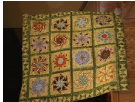
Stack n Whack by Ora Mae Kirkendall

The quilts featured in this new book are reminiscent of the Art Nouveau Style of the early 1900's. Each block is a different appliqué pattern. The beautiful floral design patterns are included for the quilt. Other smaller projects included in the book are a miniature quilt, a tote bag, a table runner, and a wall hanging.