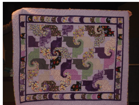
Rachel Moreland's Cats in Purple