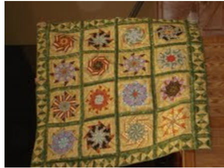
Ora Mae Kirkendall's stack'n'whack