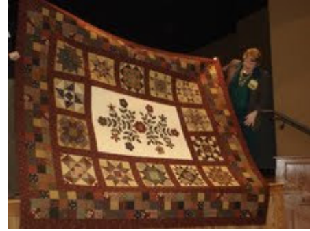
Sharon Pollman--sampler with appliqué medallion center in browns