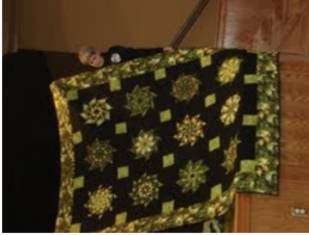
Sharon Pollman--stack'n'whack in greens on black background