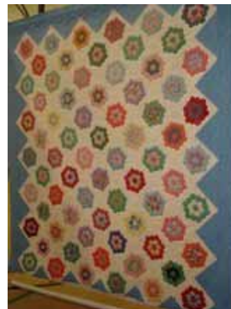
old Grandmother's Flower Garden