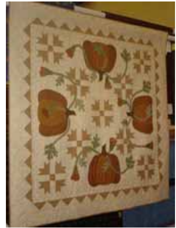
Nancy Graves Goosetracks in the Pumpkins