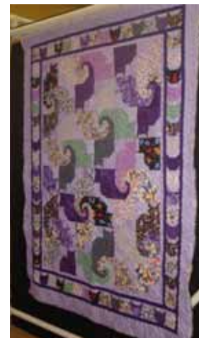
Rachel Moreland Cats in Purples