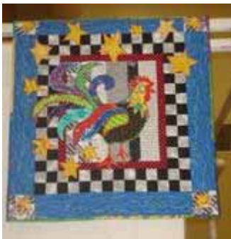
Susie Weir Chicken 'N Stars