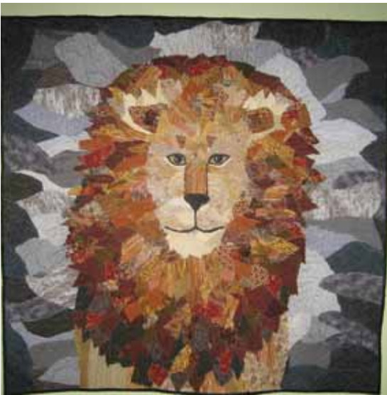
Kathryn Burden—Nigel Contemplating life

In addition to the monthly drawing for prizes for completed blocks, there will be an end-of-the-year drawing for all those who complete all 12 blocks.