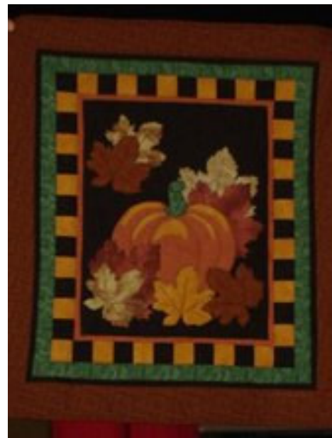
Nayola Norris Fall pumpkin and leaves wall hanging

Reminder: It's that time again. Dues for 2010 are due beginning with the October Meeting.