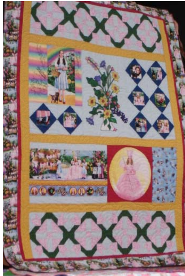
Wizard of Oz quilt, a fundraiser for restoring Wamego’s little train depot.